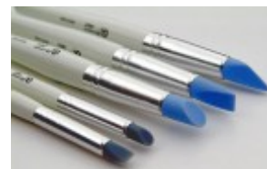
Scrapy Tools 99531000

... can be used to push, dab, texture, pattern, apply wax colour, lift off colour, wipe off or smear on, etc. Differing shapes and qualities offer differing porosity, absorbency, shape, etc